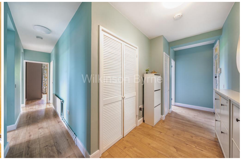
These particulars, whilst believed to be accurate set out as a general outline only for guidance and do not constitute any part of an offer or contract. Intending purchasers should not rely on them as fittings. Room sizes should not be relied upon for carpets and furnishings. The measurements given are approximate. No person in this firm's employment has the authority to make or give any representation or warranty in respect of the property.