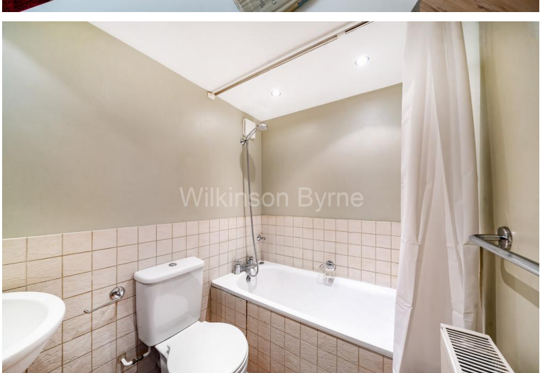
These particulars, whilst believed to be accurate set out as a general outline only for guidance and do not constitute any part of an offer or contract. Intending purchasers should not rely on them as fittings. Room sizes should not be relied upon for carpets and furnishings. The measurements given are approximate. No person in this firm's employment has the authority to make or give any representation or warranty in respect of the property.